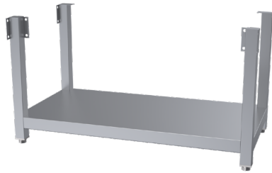
SCG-48SS stand, no casters