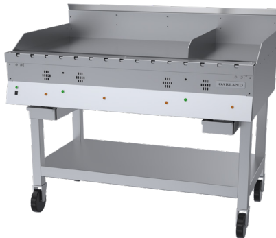
Model CG-48FCH on SCG-48SSC stand with casters