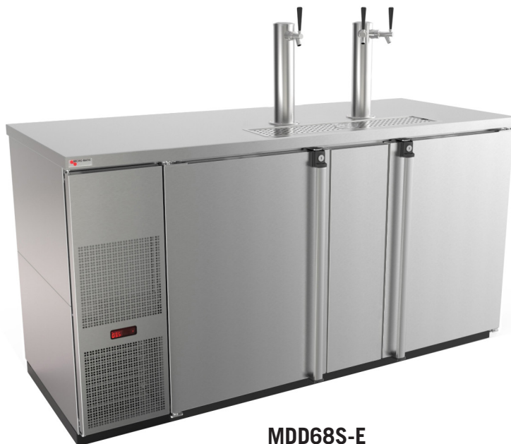
MDD68S-E Stainless Steel