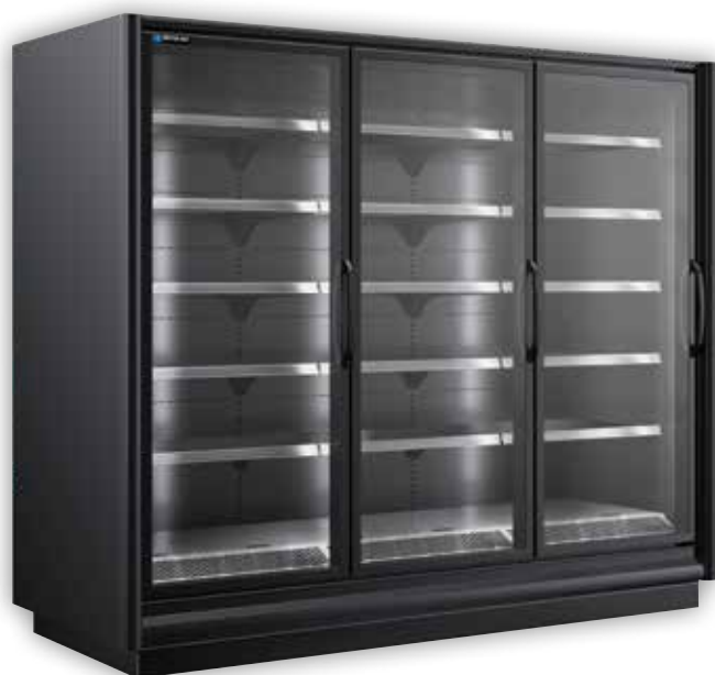
BEM-3-30/BEL-3-30 (shown with ends installed)