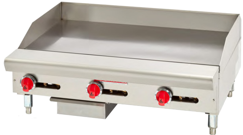
Model Shown ARSMG-36