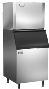
CIM0330HA90 shown atop of bin B55 (sold separately)

See Ice-O-Matic Price List for Adapter Kits to combine ice makers with most available ice/beverage dispensers.