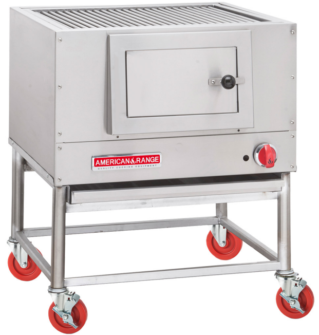
Model Shown AMSQ-30