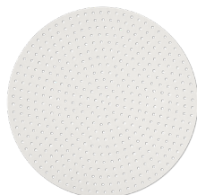
Silicone Anti-Scorch Pad