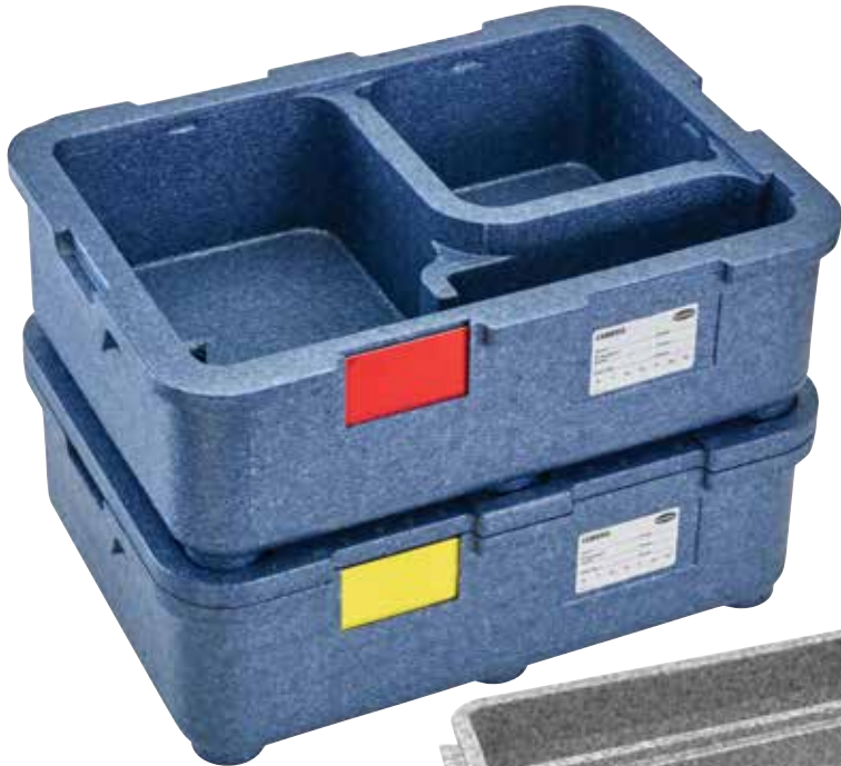
EPPMD4835 Cam GoBox Lunchbox