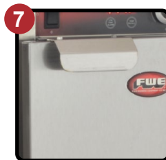
Work Flow Handle