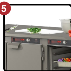
Stainless Steel Work Top