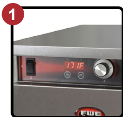
Individual Heat Controls