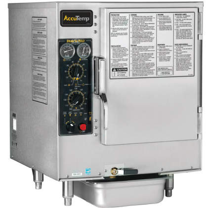
S6 Countertop Steam&Hold™ Steam Cooker shown with optional 4" adjustable legs and 4" drain pan

Steam&Hold™ steamer is AccuTemp Products patented vacuum technology steam cooker with 3 operating modes. Fast cook (212°F), low temperature steam mode (150–200°F) and certified variable temperature hold mode. Steam to be produced inside the cooking cavity with no heating element exposed to water. No water or drain line required. Unit to include heavy duty door which will open at any time during cooking cycle. Steamer to include low water indicator light and buzzer with auto shutdown feature. Unit to be UL, CE, and ENERGY STAR® qualified. Built in the USA.